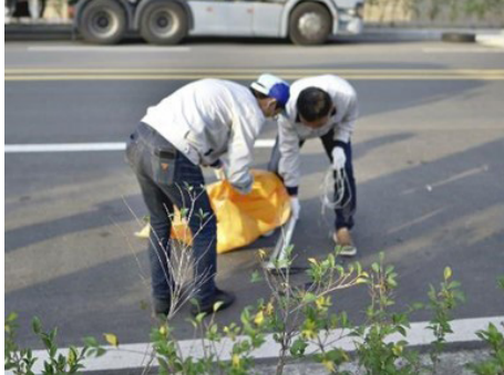
Cleaning activities around the plant

KSM (Korea) conducts annual clean-up activities on roads surrounding industrial parks where its plant is located. In FY2022, KSM reduced the scope of its activities to prevent the spread of COVID-19.