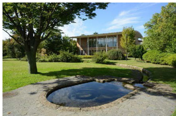
Kurita Sogo Center

The Kurita Sogo Center is a place of recreation and relaxation where people passing by can experience a breath of nature in each of the four seasons, including cherry blossoms in the spring and autumn leaves in the fall.