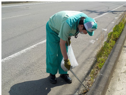
Cleanup activities around the plant being conducted (Takaoka Plant)

Shinko carries out beautification activities, such as picking up garbage, around its plants, mainly during Environment Month, which is held every June. We will continue to work steadily to ensure that the beautiful environment around the plant is passed on to future generations.