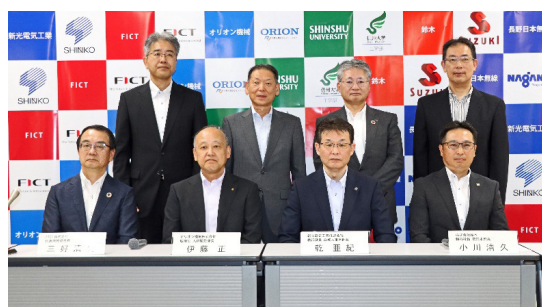
July 20, 2023 Press Conference at Shinshu University (conference participants from Shinshu University and donor corporations)

The working population is expected to decrease in the future, and improving work efficiency and productivity through the use of digital technology is one of the important initiatives for eliminating the impact of the decline in the labor force. Our company will work together with the university to ensure that this industry-academia collaboration not only solves problems in the industrial world but also leads to the realization of a vibrant local community.