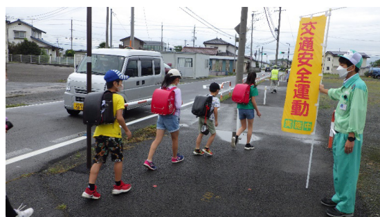
Awareness Campaigns on Traffic Safety

In conjunction with the National Traffic Safety Campaign, we conduct awareness campaigns on traffic safety. Especially, we are working to prevent traffic accidents involving children by calling out to local elementary school students and watching over them so that they can safely go to school. To help realize a society with zero traffic accidents, we will work together with local residents to encourage people to observe all traffic rules and to practice traffic safety.