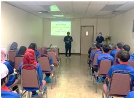
Orientation for students

It is also promoting community-based activities, such as participation in a monitoring program by neighboring companies to maintain and improve safety in the industrial area surrounding SEM.