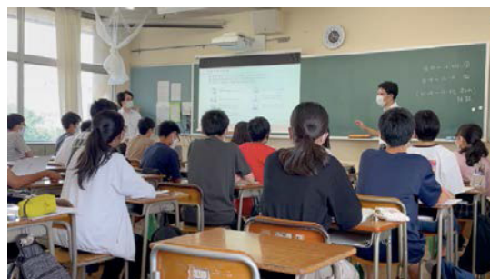
Career support education activities for high school students

Employees visit their alma maters and explain the nature of work in the manufacturing industry and Shinko's profile, as well as introduce their own experiences. This is an opportunity to help students choose their future career paths.