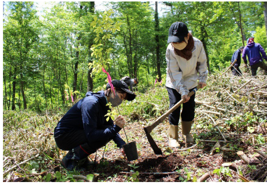
Tree planting in May, 2022

In FY2022, in collaboration with the labor union, we carried out various forms of forest maintenance in May and November, including planting of saplings, cutting of undergrowth, and maintenance of walking trails by scattering wood chips. We will continue forest development activities in collaboration with local communities.