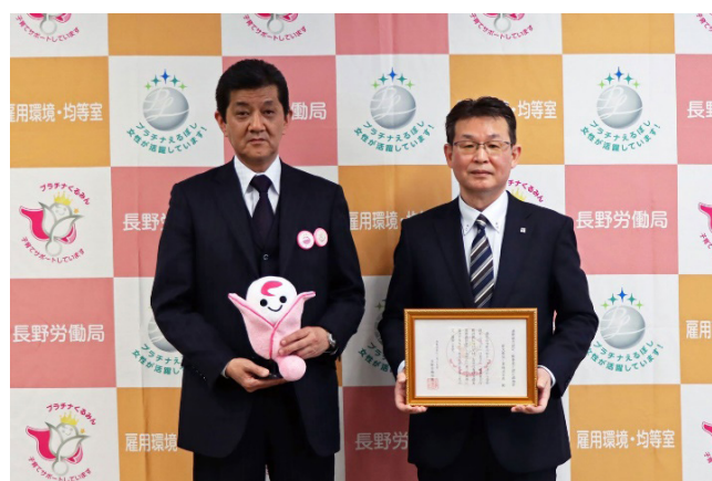
January 27, 2023 Certification Presentation Ceremony