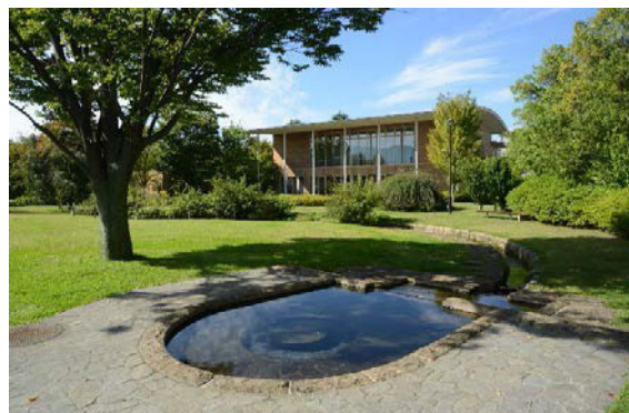
(Kurita Sogo Center)

Since then, Kurita Sogo Center is a place of relaxation in the local community, where people passing by can experience a breath of nature in each of the four seasons, including cherry blossoms in the spring and autumn leaves in the fall.