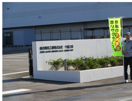
(Awareness Campaigns on Traffic Safety (Chikuma Plant))