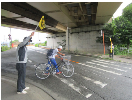
(Awareness Campaigns on Traffic Safety (Wakaho Plant))

In conjunction with the National Traffic Safety Campaign, we conduct awareness campaigns on traffic safety. Especially, we are working to prevent traffic accidents involving children by calling out to local elementary school students and watching over them so that they can safely go to school. To help realize a society with zero traffic accidents, we will work together with local residents to encourage people to observe all traffic rules and to practice traffic safety.