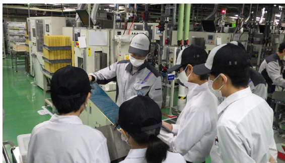
(Plant tour (Kohoku Plant))

We also accept local student internships at its sites in Japan as well as at its overseas site, SHINKO ELECTRONICS (MALAYSIA) SDN. BHD. (SEM) in Malaysia, while support them in the hope that these internships will provide an effective foothold for students who will lead the next generation to establish their outlook on work and discover their abilities.