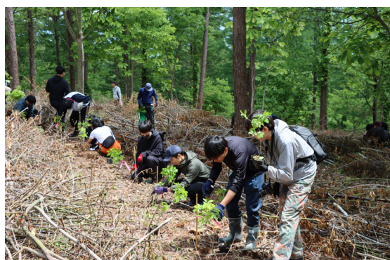
(Tree planting (May))

We participate in the adopt-a-forest program promoted by Nagano Prefecture and are working with Iizuna Town on forest maintenance in forests owned by the town around Lake Reisenji. Since the signing of the "adopt-a-forest program" in October 2014, we have conducted various forms of forest maintenance every year jointly with the labor union, and in FY2024, we planted saplings and cleared underbrush in May and October. We will continue to work with the local community to protect rich natural resources through sustainable forestation activities.