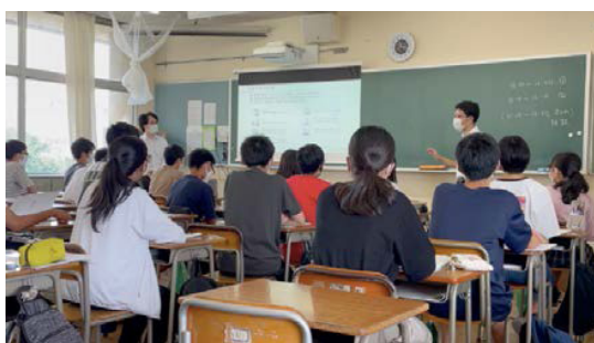
(Career support education activities for high school students)

Our employees give lectures at high schools and universities for the purpose of fostering human resources who can play an active role in industry and for career education. Employees visit their alma maters and explain the nature of work in the manufacturing industry and Shinko's profile, as well as introduce their own experiences. This is an opportunity to help students choose their future career paths.