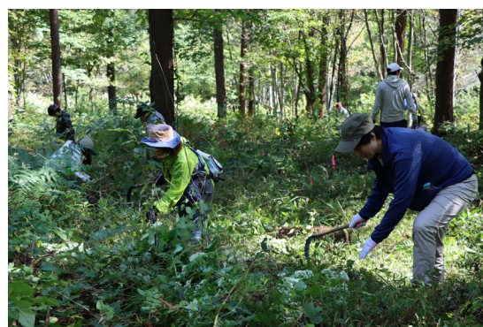
(Cutting of undergrowth (October))