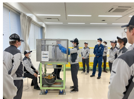
(Hazard Perception Education to improve the hazard sensitivity)