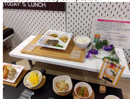
(Employee cafeteria menu: smart meals)

We also promote healthy activities, such as walking, using a smartphone app and events that encourage people to stop smoking. Our cafeterias offer nutritionally balanced "smart meals" containing food items that contribute to health, as well as meals tailored to healthy themes on Food Education Day (19th of every month). In these ways, we cooperate with employee cafeterias and health insurance association to help employees maintain and increase their health.