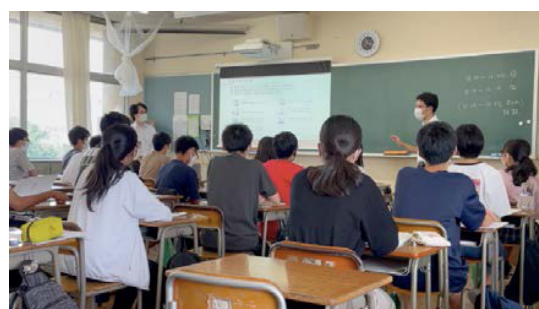
(Career support education activities for high school students)

Employees visit their alma maters and explain the nature of work in the manufacturing industry and Shinko's profile, as well as introduce their own experiences. This is an opportunity to help students choose their future career paths.