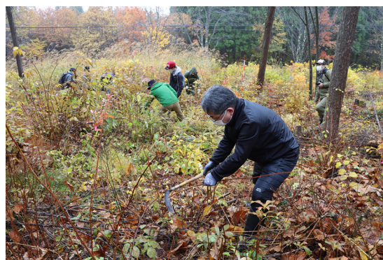
(Cutting of undergrowth (October))