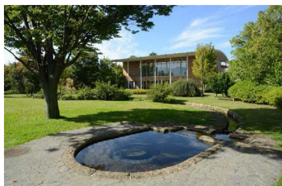
(Kurita Sogo Center)

The Kurita Sogo Center is a place of recreation and relaxation where people passing by can experience a breath of nature in each of the four seasons, including cherry blossoms in the spring and autumn leaves in the fall.