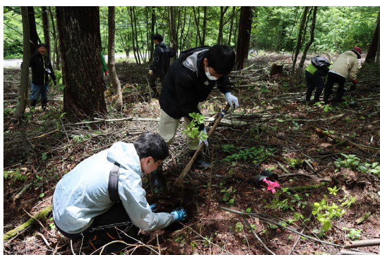
(Tree planting (June))

We participate in the adopt-a-forest program promoted by Nagano Prefecture and are working with Iizuna Town on forest maintenance in forests owned by the town around Lake Reisenji. Since the signing of the "adopt-a-forest program" in October 2014, we have conducted various forms of forest maintenance every year jointly with the labor union, and in FY2023, we planted saplings and cleared underbrush in June and October. We will continue to work with the local community to protect rich natural resources through sustainable forestation activities.