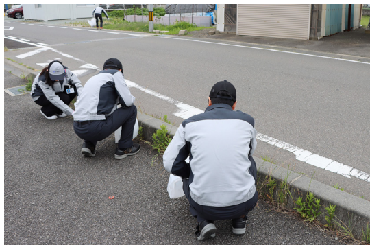
(Cleanup activities around the plant being conducted (Kohoku Plant))

Shinko carries out beautification activities, such as picking up garbage, around its plants, mainly during Environment Month, which is held every June. We will continue to work steadily to ensure that the beautiful environment around the plant is passed on to future generations.