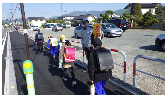
(Awareness Campaigns on Traffic Safety)

Especially, we are working to prevent traffic accidents involving children by calling out to local elementary school students and watching over them so that they can safely go to school. To help realize a society with zero traffic accidents, we will work together with local residents to encourage people to observe all traffic rules and to practice traffic safety.