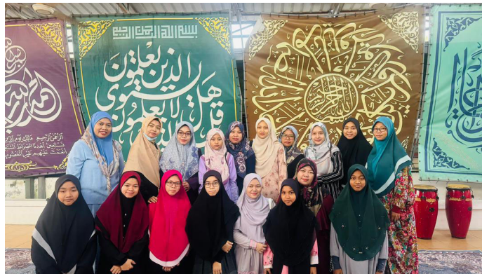
(Visit an orphanage)

SEM (Malaysia) has been making donations to orphanages, and in FY2023, employees from SEM visited orphanages to deepen exchanges with the children.