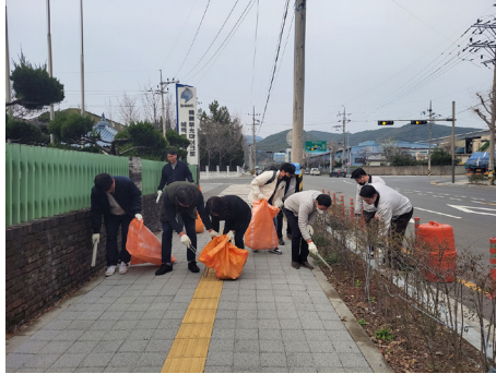
(Cleaning activities around the plant)

KSM (Korea) conducts annual clean-up activities on roads surrounding industrial parks where its plant is located. Along with clean-up activities, we also conduct educational activities to prevent unauthorized dumping of garbage.