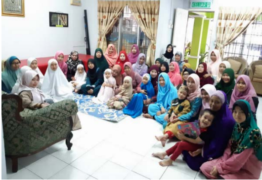
Visit to an orphanage

Once a year, SHINKO ELECTRONICS (MALAYSIA) SDN. BHD. (SEM: Malaysia) makes donations to an orphanage. In FY2018 it donated food and clothing, in addition to money. Moreover, around 40 employees visited the orphanage and spent time with the children.