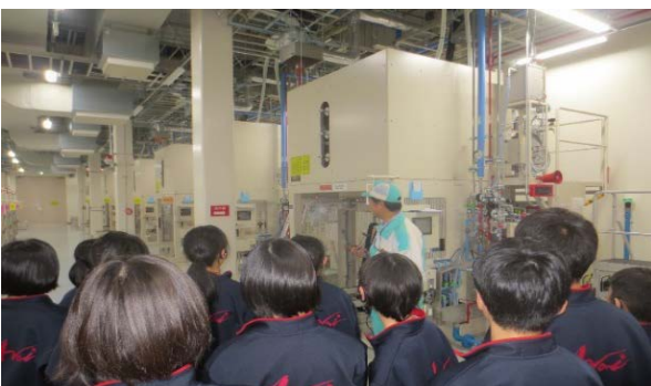
Tour of the Arai Plant by junior high school students

In FY2018, SEM (Malaysia) provided internships to college students majoring in chemistry or mechanical engineering.