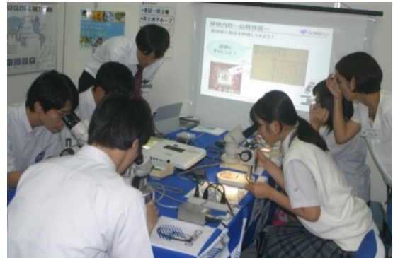
Shinko’s booth at Future View Nagano

The theme of Shinko’s booth was “Explore the Inner Workings of Electronics!” We prepared samples of Shinko products on which were designed micro-scale circuit mazes for students to try and get through using a microscope. The comments from students included, “I was surprised at the detailed work, but it was fun to experience.”