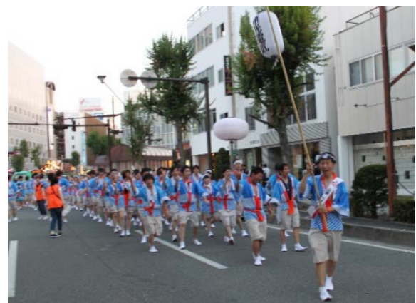
Dancing at the Nagano Binzuru Festival

In addition, each plant sponsors and cooperates with local events held throughout the year.