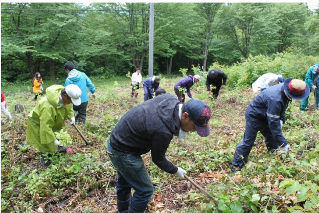
Tree planting in June

Taking advantage of the adopt-a-forest program promoted by Nagano Prefecture, we concluded an agreement in October 2014 to conduct maintenance in collaboration with Iizuna Town in forests owned by the town around Lake Reisenji. In FY2018, Shinko and the labor union co-organized forest maintenance work, including the planting of about 500 saplings and clearing of undergrowth in June and October.