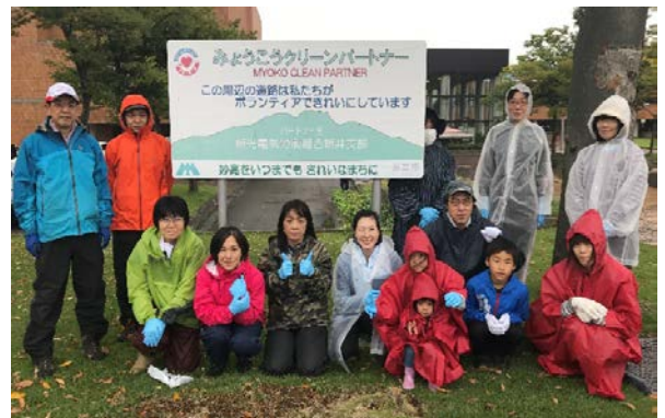
Activities at Myoko City Clean Partners

Additionally, Shinko has an accumulated paid leave program that allows employees to accumulate and take up to 20 days of paid leave for specific purposes, including volunteering at public organizations.