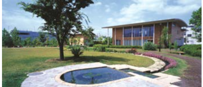
28th Nagano City Good Landscape Award Winner (2015)

This expansive green space also plays the role of a temporary evacuation site for the surrounding area, and is deeply intertwined with the lives of local people.