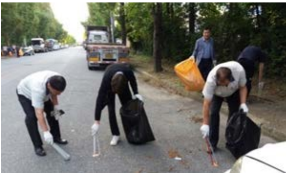
Cleanup activities around plants being conducted by KSM

Also, KOREA SHINKO MICROELECTRONICS CO., LTD. (KSM: Korea) conducts annual cleanups along the roads and a river near its plant.