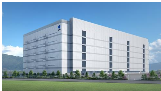
Perspective image of Chikuma Plant

Flip-chip type packages for high-performance semiconductors, such as the CPUs used in PCs and servers, are expected to remain in strong demand as semiconductor packages that support higher performance, higher speed, and more energy savings for semiconductors. SHINKO has been working to reinforce the production system for flip-chip type packages at the Kohoku and Wakaho Plants, both located in Nagano City, as well as the Takaoka Plant in Nakano City, Nagano Prefecture. To reinforce our production system even more, the new plant will be located in Chikuma City, Nagano Prefecture, as previously mentioned in the SHINKO news release Capital Investments for Growth Markets dated October 4, 2021. This brings our number of plants to six.