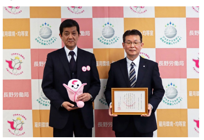
January 27, 2023 Certification Presentation Ceremony